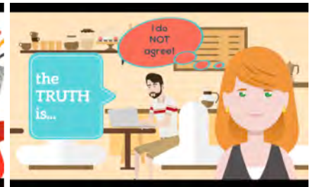
'True for you, not for me!'