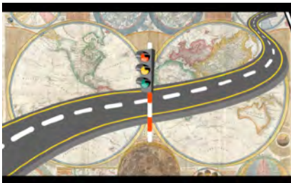
The Bible: guide for life