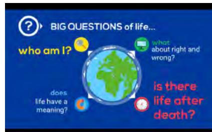
The big questions of life