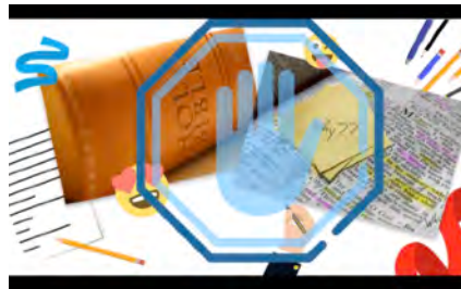
The Bible: image problem